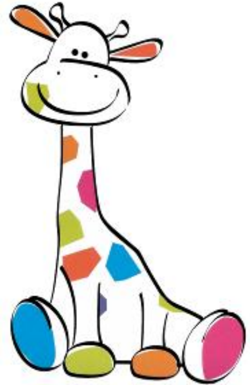
Casper 22 November 2011